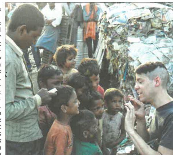
Founder Hands 4 Zero Poverty (www.h4zp.org)

May this Advent evoke in us true Christ-like compassion for the poor and a resolve to find imaginative ways ourselves to bring good news to the poor and to share what we can give, remembering the challenge of Saint Teresa of Kolkata: "This is the paradox: that if you give until it hurts, there can be no more hurt, only more love."