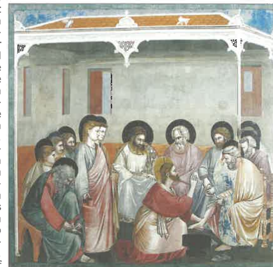
Washing of the Feet, a fresco in the Capella del Scrovegni, Padua, Italy by Giotto, 1305 AD